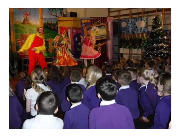
School Pantomime – more photos on page 3

On Tuesday Year 3 went to the Kings Church in Selby to visit their Christmas experience (photos on page 3). They had a wonderful time!