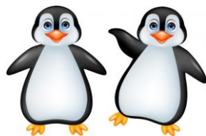
Polly and Percy the penguins are resilient