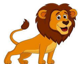
Lottie the lion concentrates

There will be more information on the school website shortly