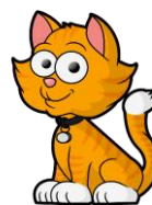
Colin the cat is curious