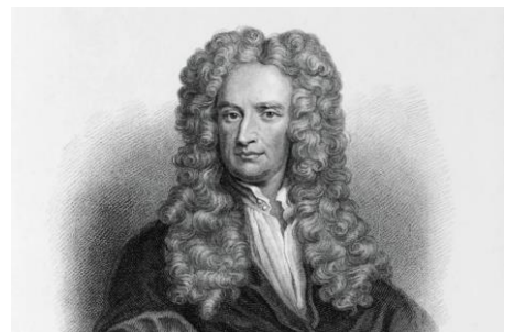
Sir Isaac Newton