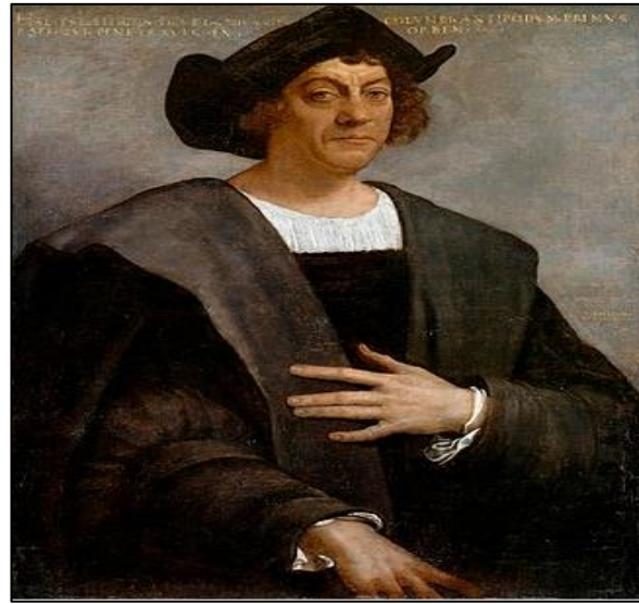
A portrait of Christopher Columbus from 1519

Many people at the time believed that the world was flat. Columbus aimed to prove that Earth was round.