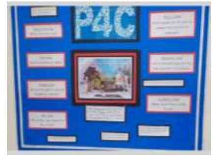
Whole school enquiry based on St George and the Dragon by Paolo Uccello