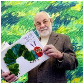
Eric Carle – Children's Author